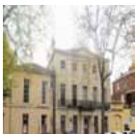
Bexhill On Sea 77 Units