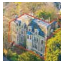
Surbiton 5 Units