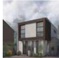
Edmonton 15 Units