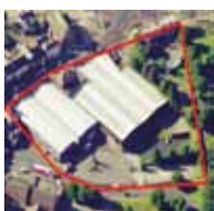
Surrey 185 Units