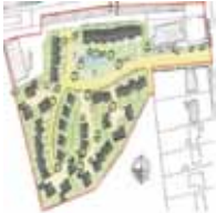
Cambridge 60 Units