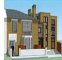
Harringay 8 Units