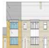
Forest Gate 22 Units