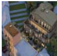
Plainstow 21 Units