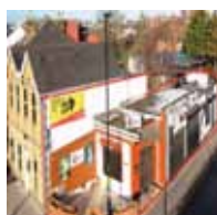
Mitcham 8 Units