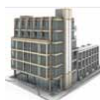
Redbridge 77 Units