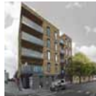
Plainstow 18 Units