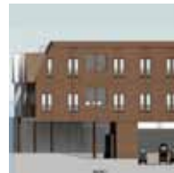
Redbridge 18 Units