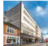
Maidstone 44 Units