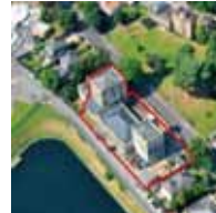
Kent 250 Units