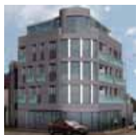
Degenham 34 Units