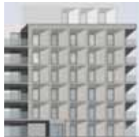
East Ham 30 Units