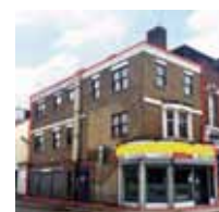
Illford 15 Units