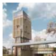
Whitchapel 9 Units