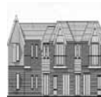
Seven Kings 28 Units