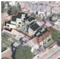
Canning Town 9 Units