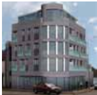
Dagenham 85 Units