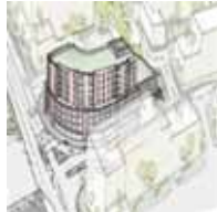
Essex 150 Units