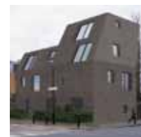
Peckham 7 Units