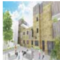
Leyton 9 Units